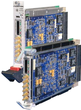
Model 53690 COTS (left) and rugged version